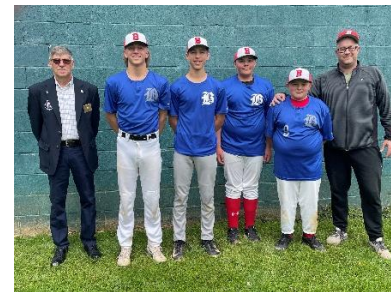
The Bellefonte Elks Lodge #1094 has reaffirmed its commitment to local youth by donating $1,250 in support of the BELLEFONTE TEENER LEAGUE baseball team. The